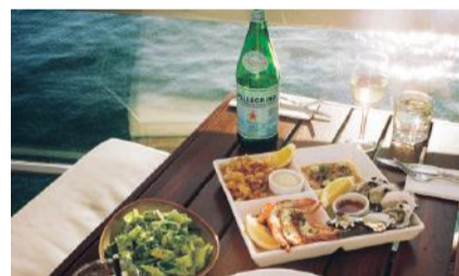
The seafood tasting plate at Hugos.

THE HIGHLIGHT In the enormous waterfront Sydney Harbour National Park, the route weaves past sandy coves framed by